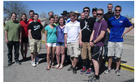
March 2 Canvassing Group